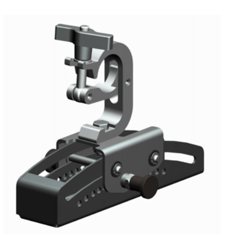
XD12 Universal bracket (Trigger clamp not included)

A universal bracket is available for the XD12 which offers a very versatile solution for mounting the cabinet. The bracket may be mounted in either the top or the bottom of the enclosure. The bracket gives quick and easy vertical angle adjustment with a spring loaded locking pin.